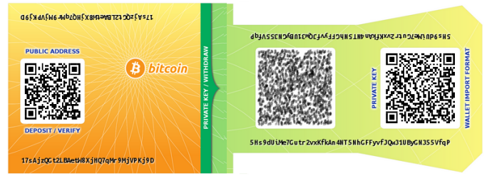
Fig. 1. Bitcoin paper wallet generated using https://bitcoinpaperwallet.com . The printout is designed to be folded such that the private key (right) remains hidden while the public component (left) remains visible.

Password-protected wallets may mislead the user to believe that the password itself provides access to their funds regardless of the location of the device storing the wallet, as would be congruent with a traditional mental model for web-based online banking. Users may be surprised to discover that they cannot access their funds at a new device by simply entering their encryption password; the wallet file must also be transferred to the new device.